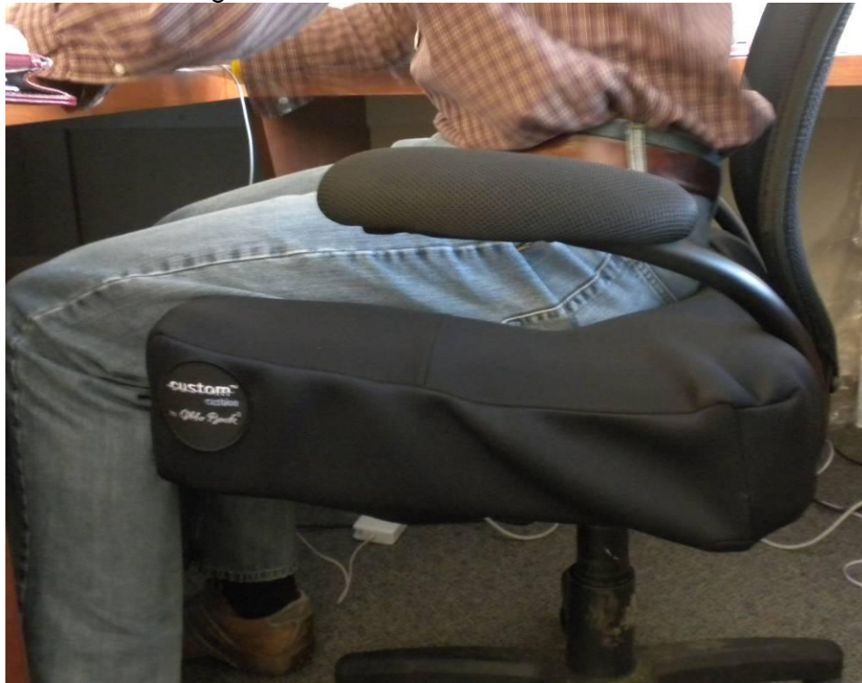
Figure 9 – Volunteer sitting trial.