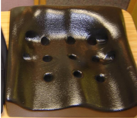
Figure 1 – OBSS vented cushion