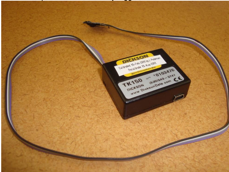
Figure 5 – Dickson temperature and humidity logger, modified model TK150.