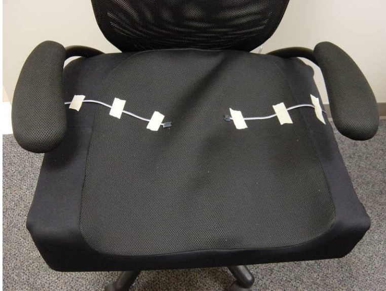
Figure 8 – OBSS Cushion testing, logger positioning.