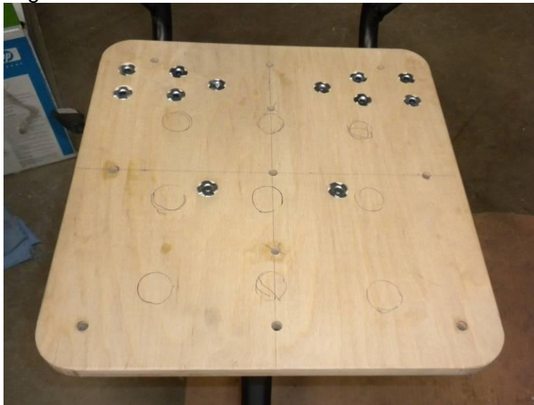
Figure 6 – Mounting board with attached back and base.