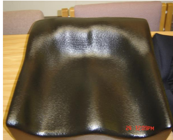
Figure 3 – OBSS unvented cushion