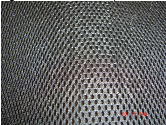
Figure 2 – OBSS cushion spacer cover